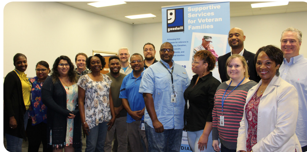
In 2018, the SSVF team moved into a large renovated office space at GICO headquarters.

Supportive Services for Veteran Families is a federal grant program of The U.S. Department of Veterans Affairs. The central Oklahoma SSVF team receives a $1.59 million grant for Rapid Rehousing and Homelessness Prevention. The Supportive Services for Veteran Families Program (SSVF) provides supportive services to very low-income veteran families who are homeless or at-risk of becoming homeless. Through the SSVF program, veterans can receive rapid rehousing assistance and employment services to improve their housing and economic stability.